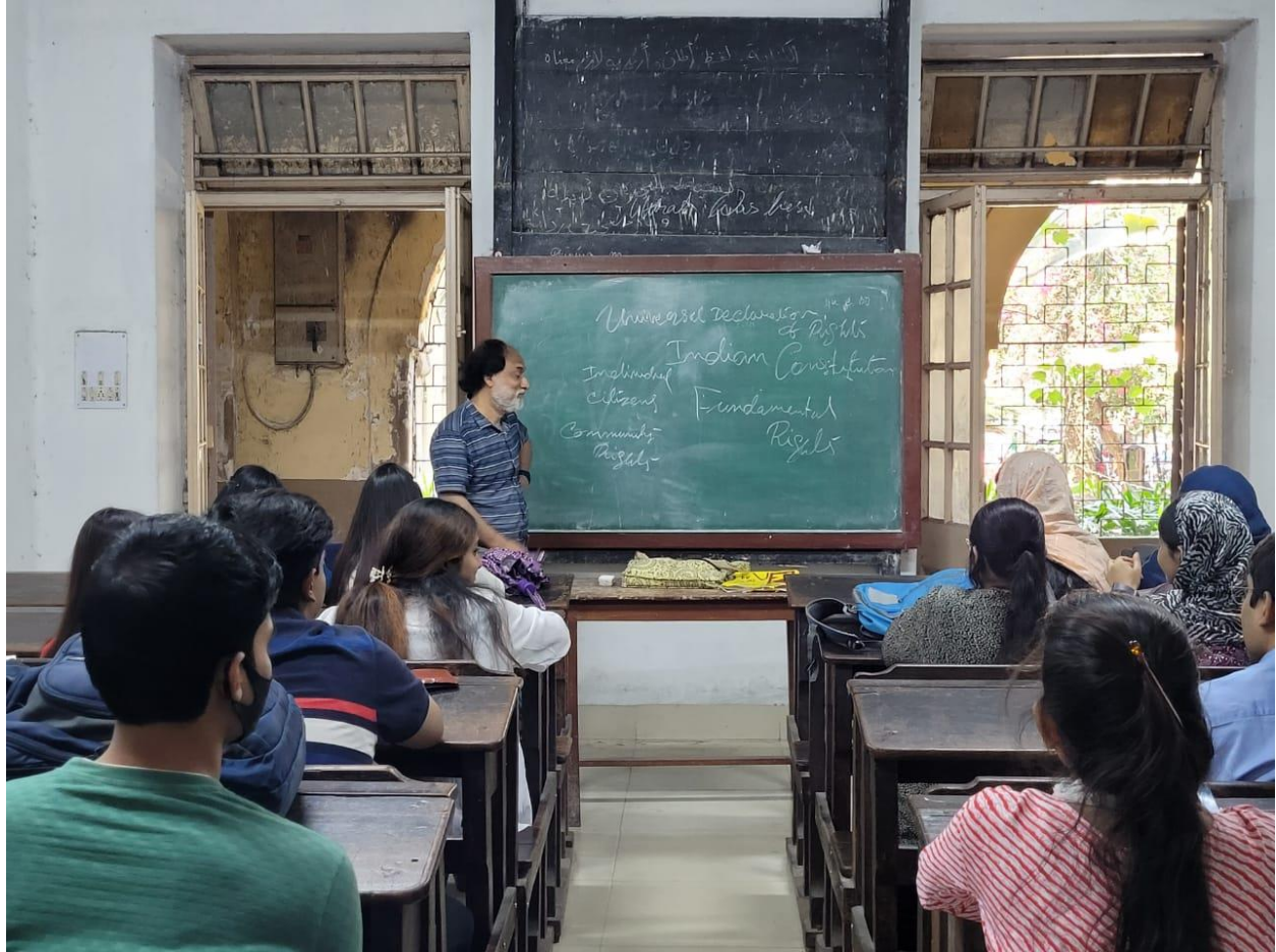
Class on Fundamental Rights by teacher of Political Science Department