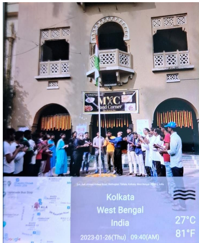
Teachers' Council Secretary unfurling the Indian tricolour at the college campus