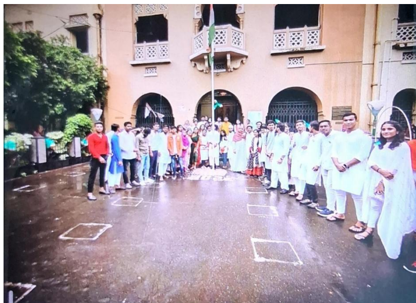
Independence Day celebrations at the college campus on 15 th August 2022