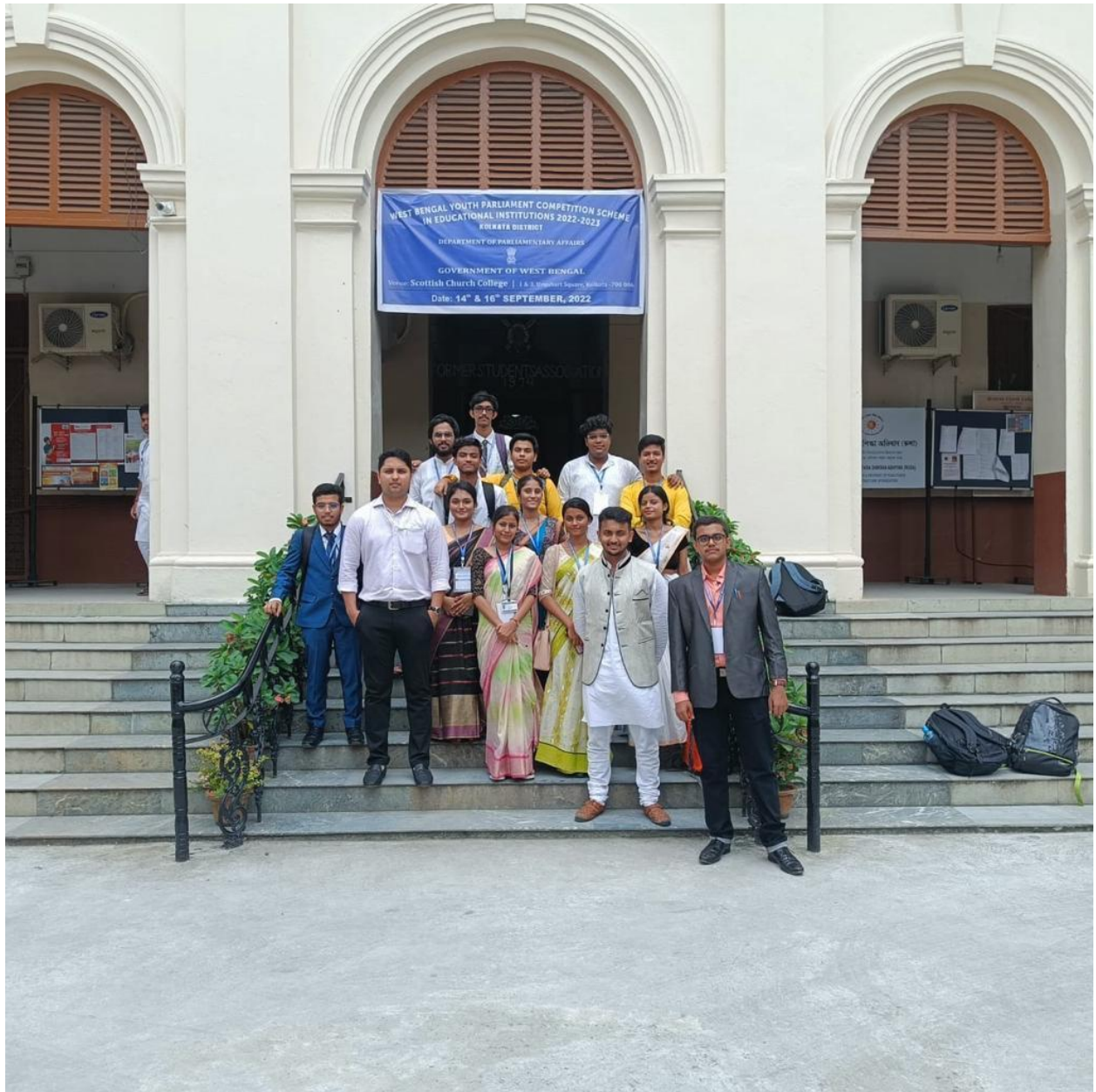
Teacher of Political Science Department with participants of West Bengal Youth Parliament Competition Scheme on 14 th and 16 th September 2022 at Scottish Church College, Kolkata.